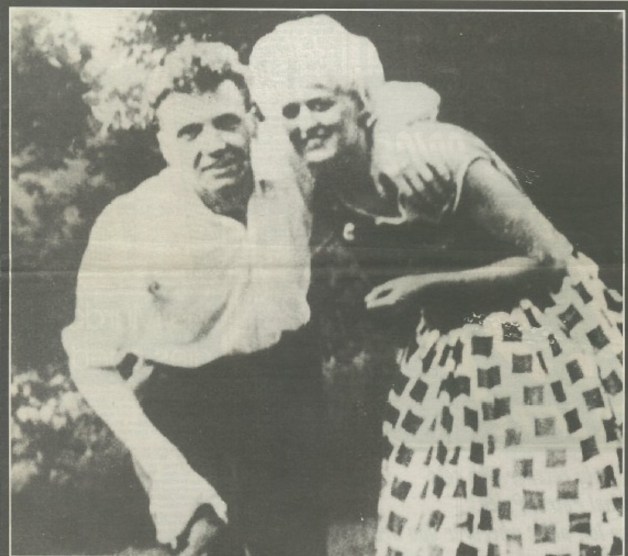
LOVERS: Wicked Myra Hindley and Ian Brady before they were jailed for life for the Moors murders. Publicly she still blames him