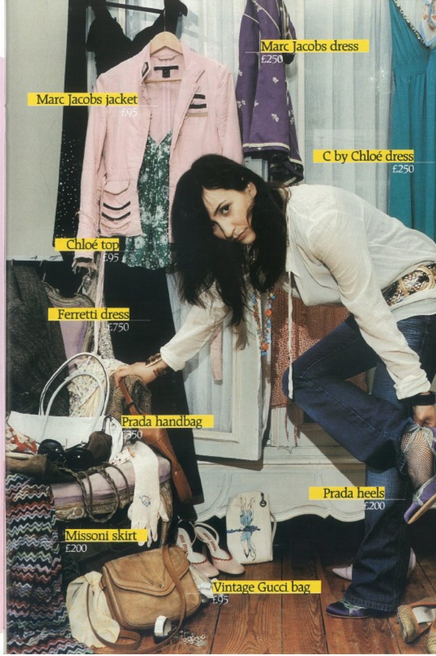
Marc Jacobs dress

'After months of splurging, I came down to earth with a bump when my credit card was refused in a shop. I'll never forget the shame – everyone behind me in the queue was staring and I couldn't pay for the few books and magazines I wanted. On my way home, I prayed it was a mistake, but knew deep down that my spending was at crisis point. ▶