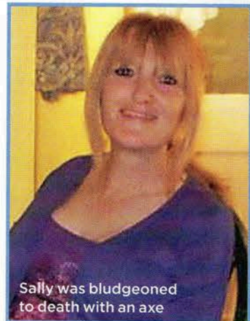
Sally was bludgeoned to death with an axe